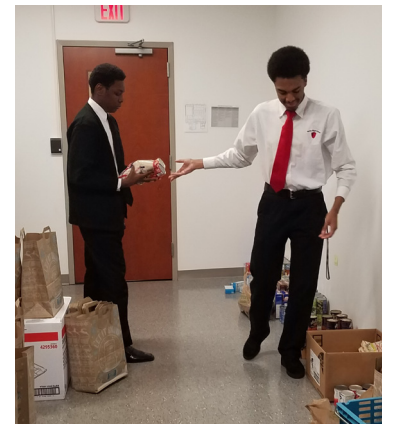
(Students in the Community Service club organize Thanksgiving food items for Rochester families in need)