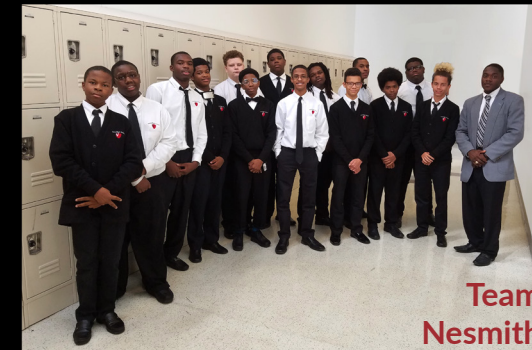
Team Nesmith September 2017