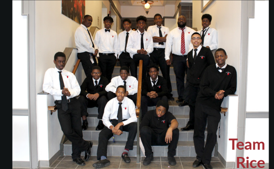
Team Rice October 2017