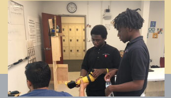
Grants Awarded to Vertus page 6