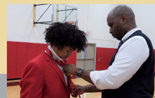
Earning Vertus Ties page 3

This experience was designed to encourage our students to look beyond their immediate environment when choosing their path and hopefully expanded their outlook to help them choose their own path.