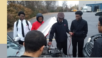
Vertus Clubs page 5