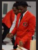
Community Service Page 6