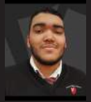
Awards Page 5