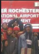
Guidance Pgs. 2 & 3

Vertus Charter High School • 21 Humboldt St. , Rochester NY, 14609 • (585) 747-8911