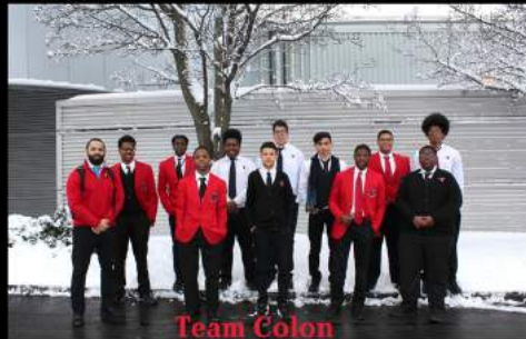
Team Colon December 2018