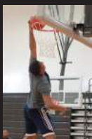
Open House Page 7