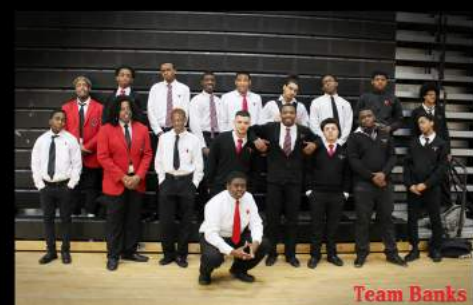
Team Banks January 2019