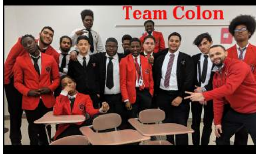
Team Colon February 2019