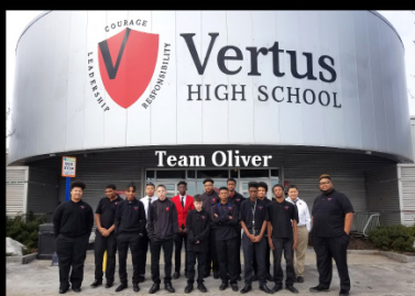
Team Oliver January 2020