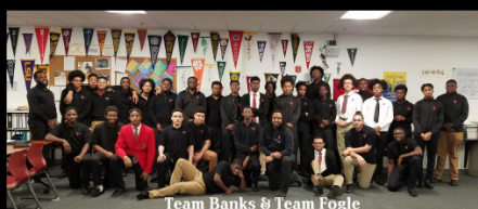
Team Banks & Team Fogle December 2019